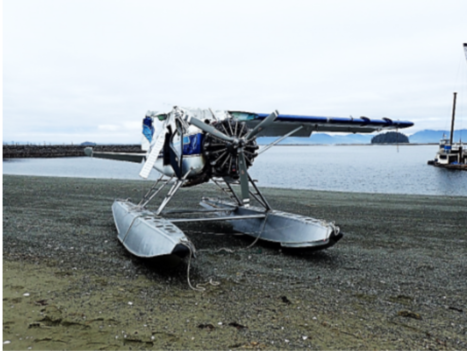
Figure 5. The airplane after recovery from the harbor.

The right wing forward fuselage attachment lug was fractured and exhibited dull, dimpled fracture surfaces; the rear attachment was fractured and deformed rearward. The right flap was attached to the fuselage by the inboard bracket, with the control rod fractured. An indentation on the right side of the fuselage was consistent with the right flap in the land position during impact. The left wing, aileron and flap were intact and attached. The left flap was extended to the land position. The cockpit flap position indicator was slightly above the land position. Flight control continuity was established from the pilot's control wheel to the left aileron and right wing aileron pulley and the elevator. Rudder and elevator trim cable continuity was established to the aft trim tabs; however, the trim cables could not be moved due to airframe deformation and cable constriction forward of the cockpit upper trim wheels.