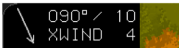
Figure 4. Chelton IDU calculated wind indication.

The airplane was configured with two Chelton Integrated Display Units (IDU) that operated as a primary flight display (PFD) and a multi-function display (MFD). The PFD displayed aircraft parameter data, including altitude, airspeed, vertical speed, and heading. The MFD displayed navigational information on a moving map, including wind information in the upper left corner, as shown in Figure 4. During normal system operation, wind was calculated during periods of relatively wings-level flight (bank < 6°). The wind calculation considered true airspeed, heading, ground speed, and track information.