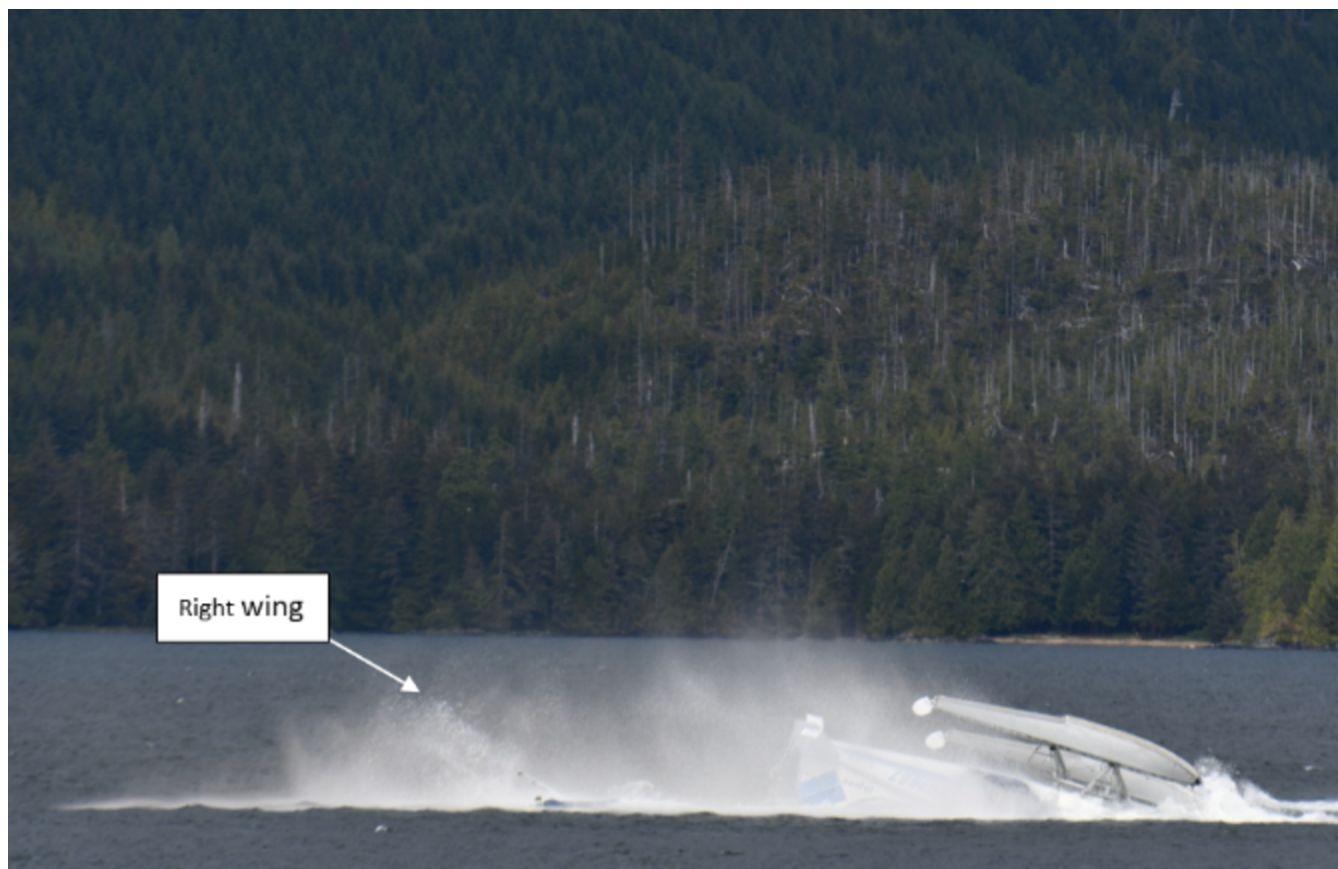
Figure 3. The airplane inverted after the accident.