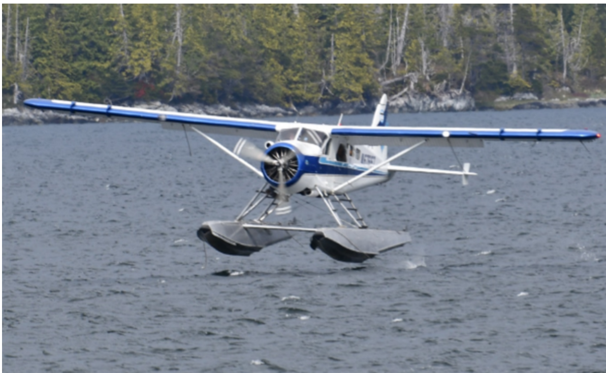
Figure 2. The airplane during the landing sequence after a brief touchdown on the left float.