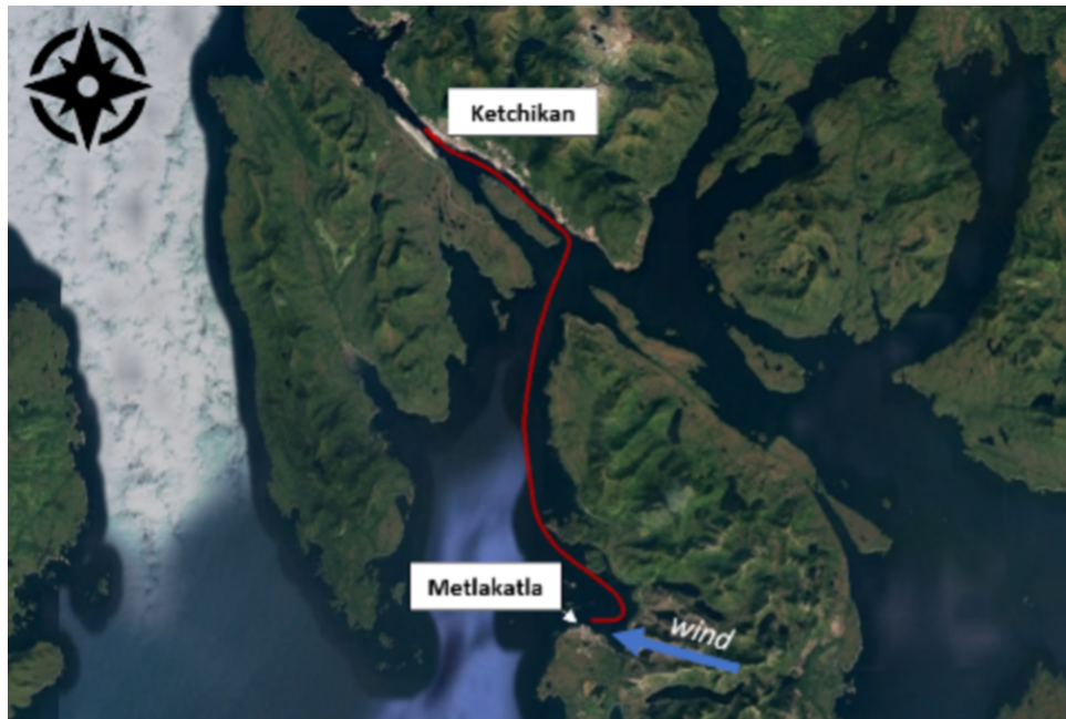
Figure 1. Flight track (red) and wind observation.

There were three witnesses to the airplane's approach and landing. One of the witnesses, who was taking photographs near the pier, reported that the wind appeared to be pushing the airplane right during touchdown and that the airplane was drifting right as the floats contacted the water. After the airplane skipped once or twice, the left wing "dipped" down, then the right wing "dipped down and dug into the water," which resulted in the airplane nosing over and the right wing separating.