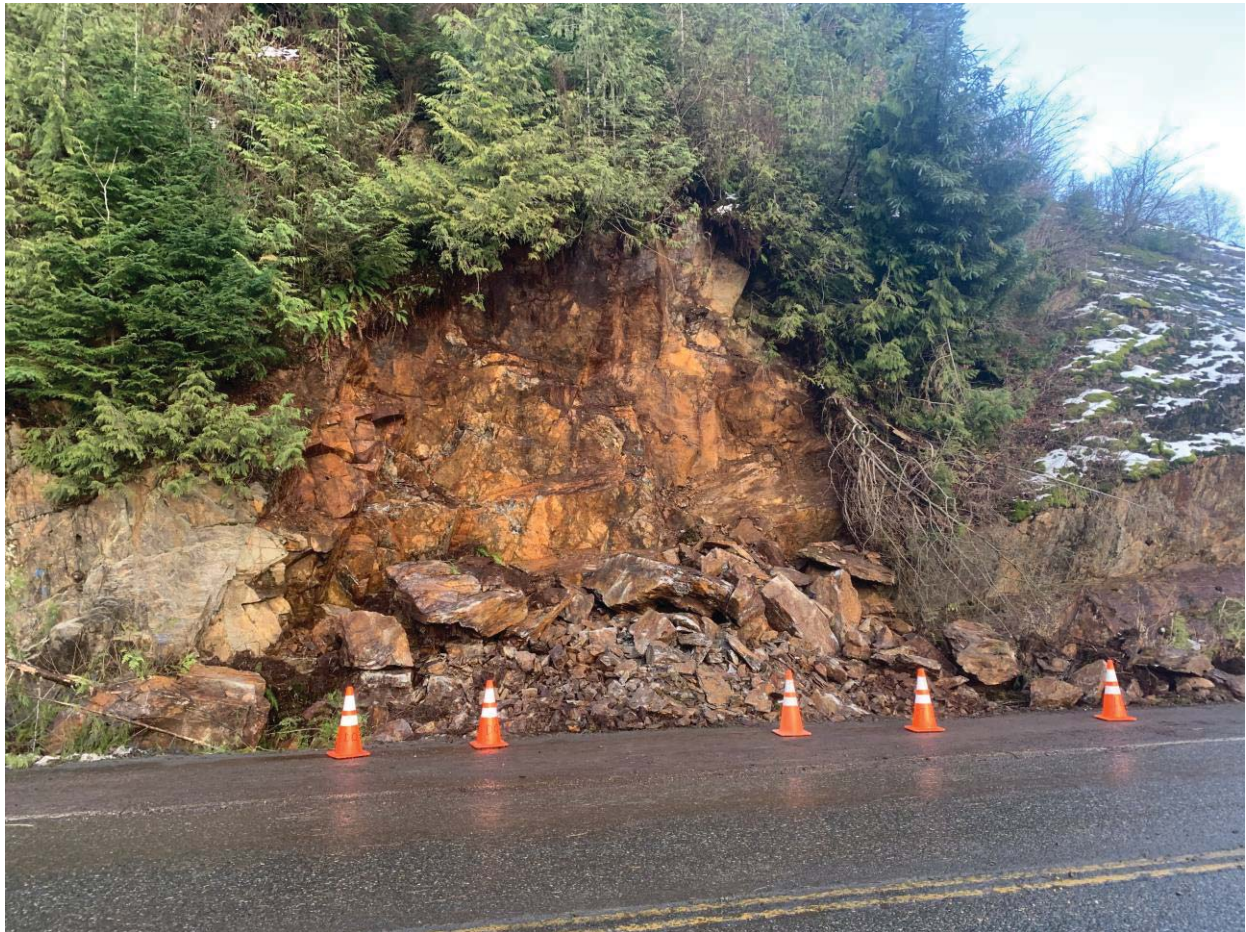
Photograph No. 1